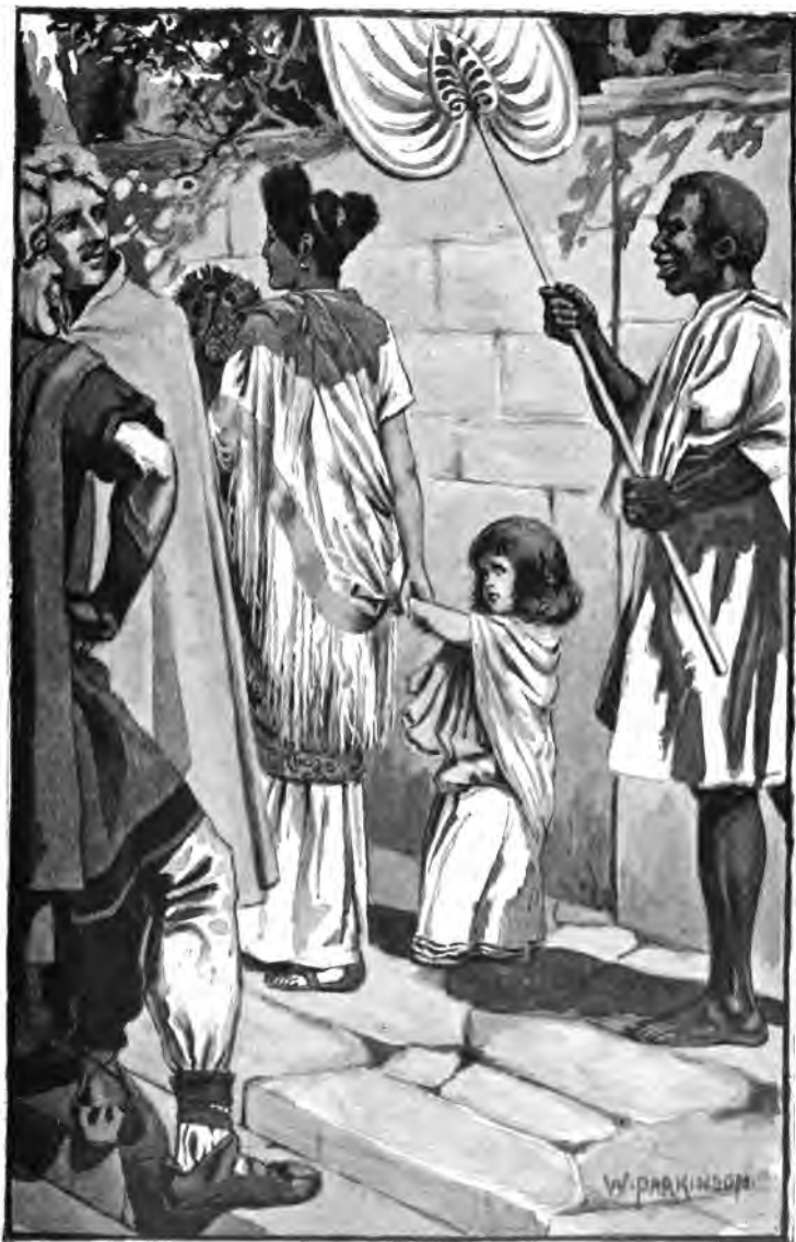
A ROMAN LADY AND HER ATTENDANT